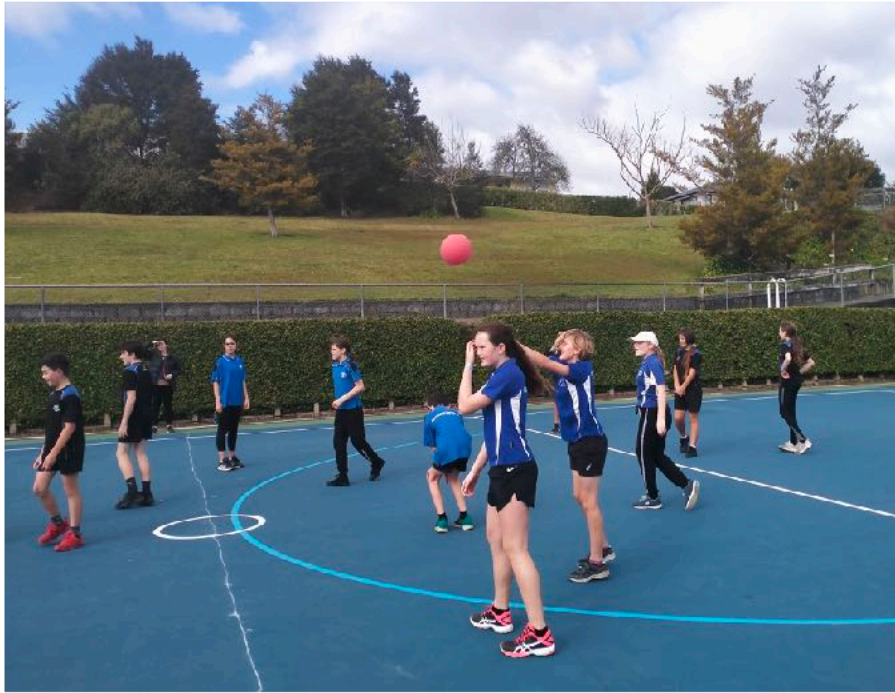
HARD COURT DAY

Anchored in MANA - Manaakitanga - Awhina - Ngākau Pono - Ako