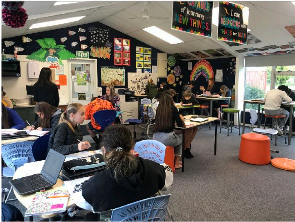
Room 1 new learning space

Anchored in MANA - Manaakitanga - Awhina - Ngākau Pono - Ako