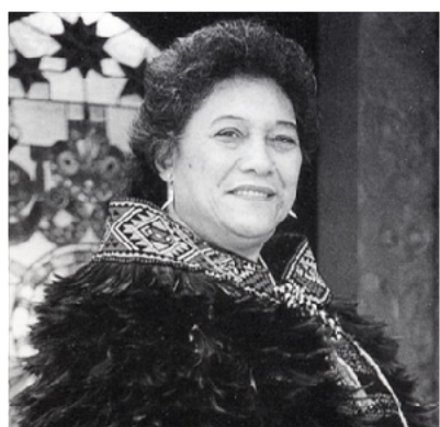
Dame Te Atairangikaahu

Children will be walking the cross country track this week, weather permitting. The postponement date for Cross Country is the following week, Tuesday 1 June.