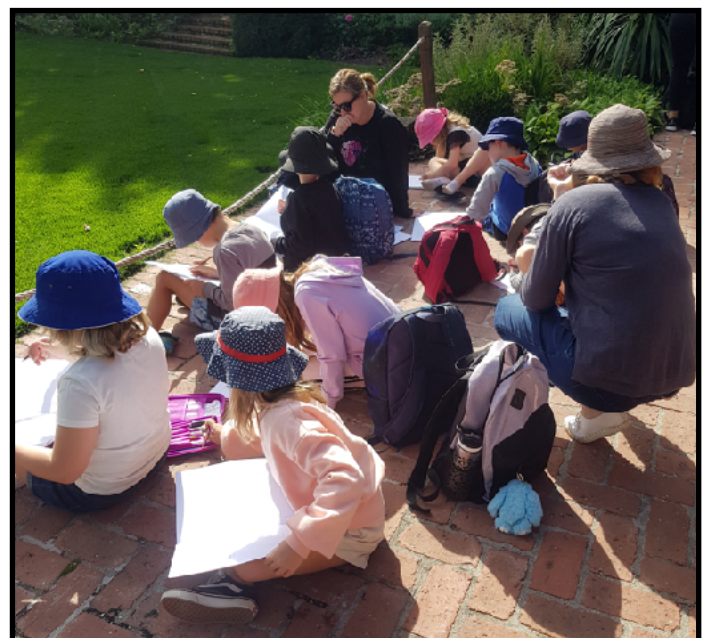
TE PIHINGA HAMILTON GARDENS TRIP