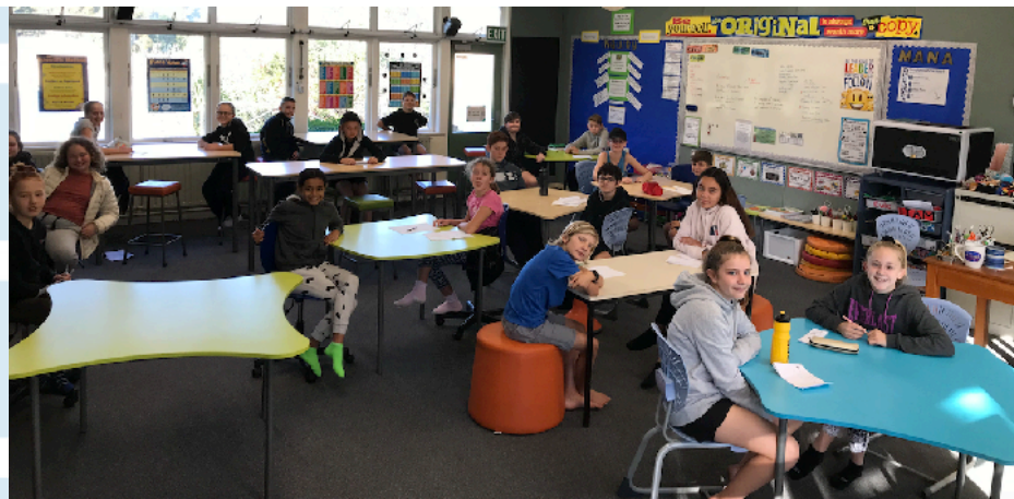
Room 1 'spread out' for class learning.