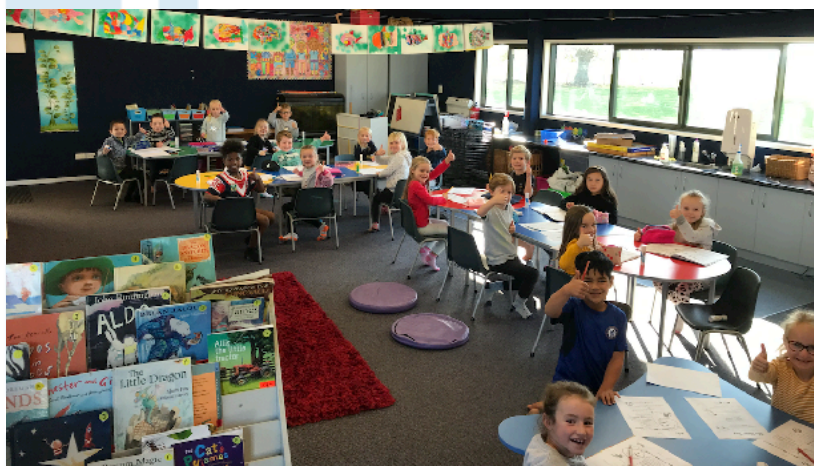
Room 10 busy at work using social distancing.

I am very impressed with our students and teachers and the way they have embraced and followed the new 'way' of doing things.